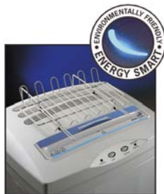
Adjustable computer forms top shelf (Space Saving Design). Integrated sliding flap makes Floppy-Disks and CDs shredding easy